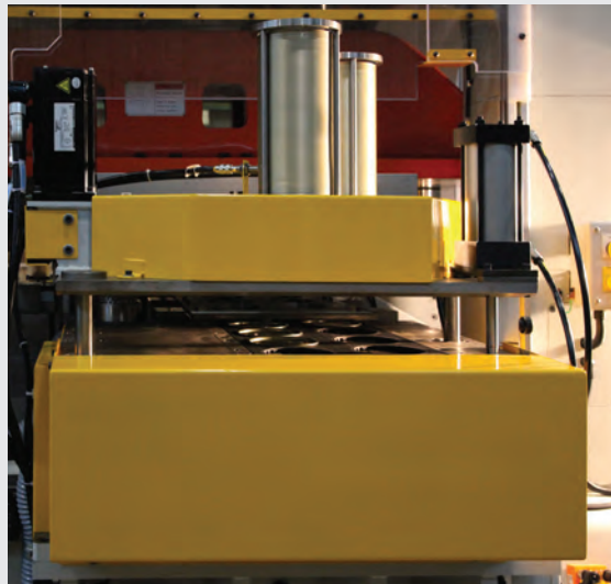
DOWNSTACKER Pneumatic Lift Function deactivated – Pneumatic Lift Function activated