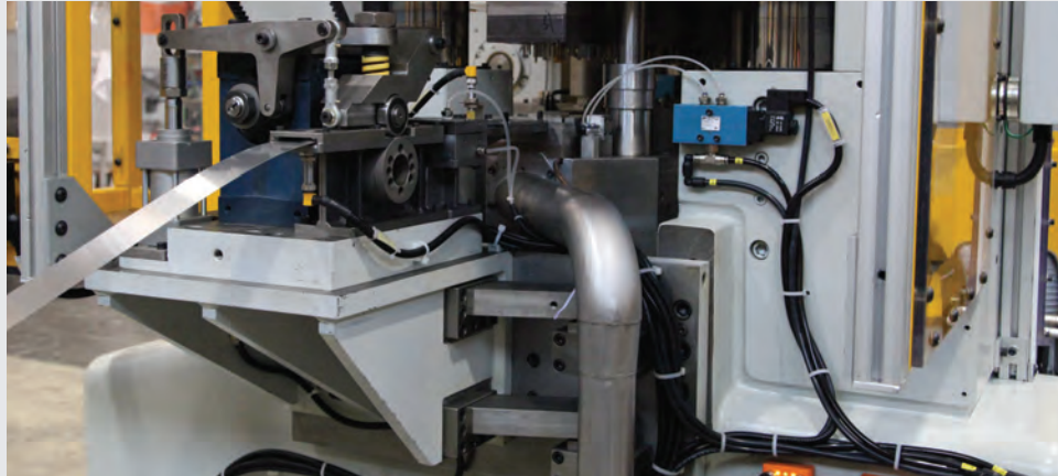
TAB ROLL FEED APRON: Opened position for pull out tap tool